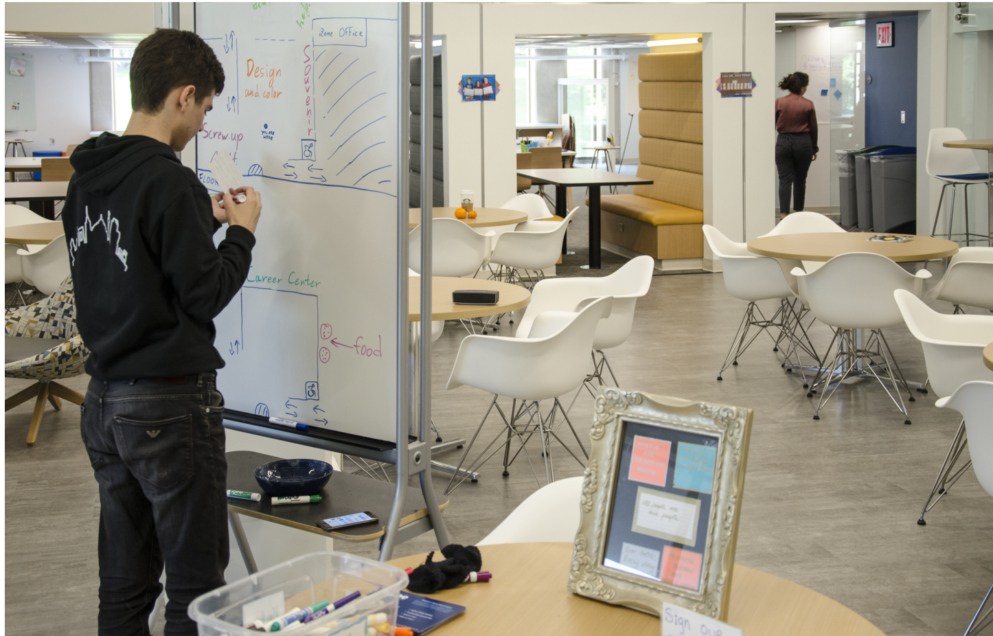
A collaborative hub for students to explore and imagine ideas for social, cultural, community or economic impact.