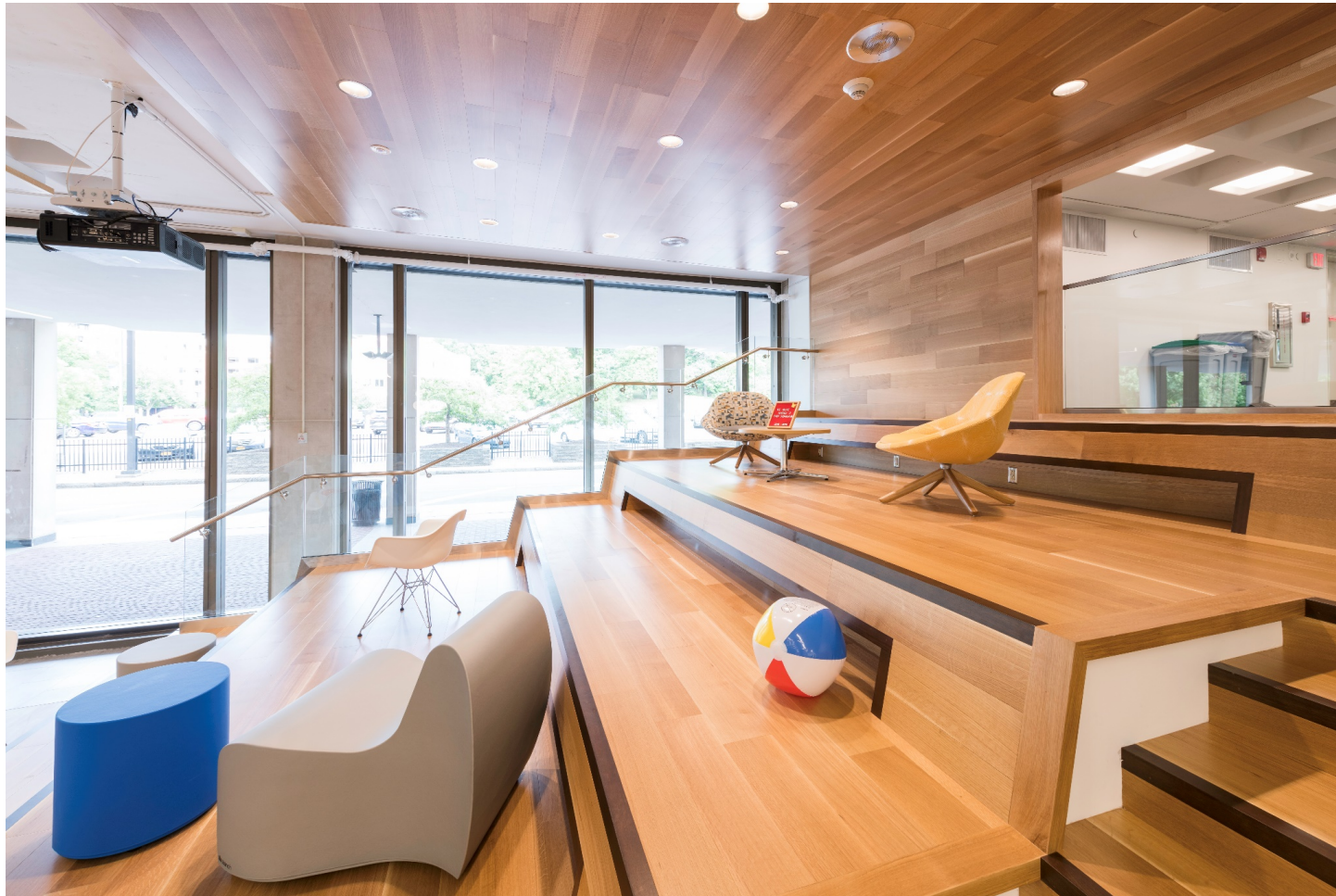
Culture of Innovation (Creativity + Play)