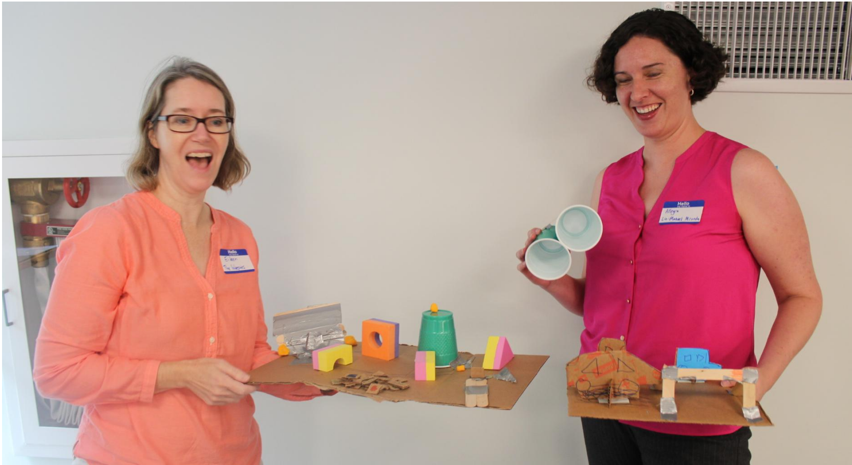
Outreach Librarians Participating in Design Thinking Workshop