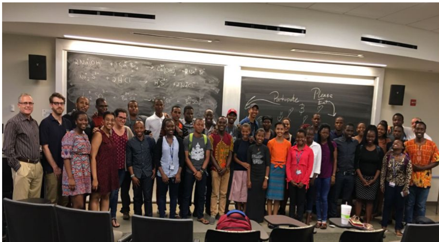
Culture of Collaboration (+ Integration)