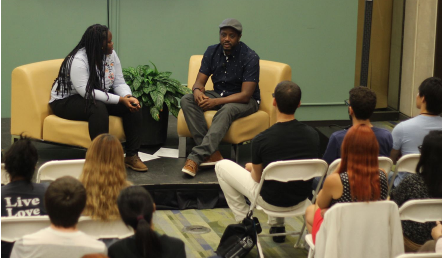
Culture of Leadership