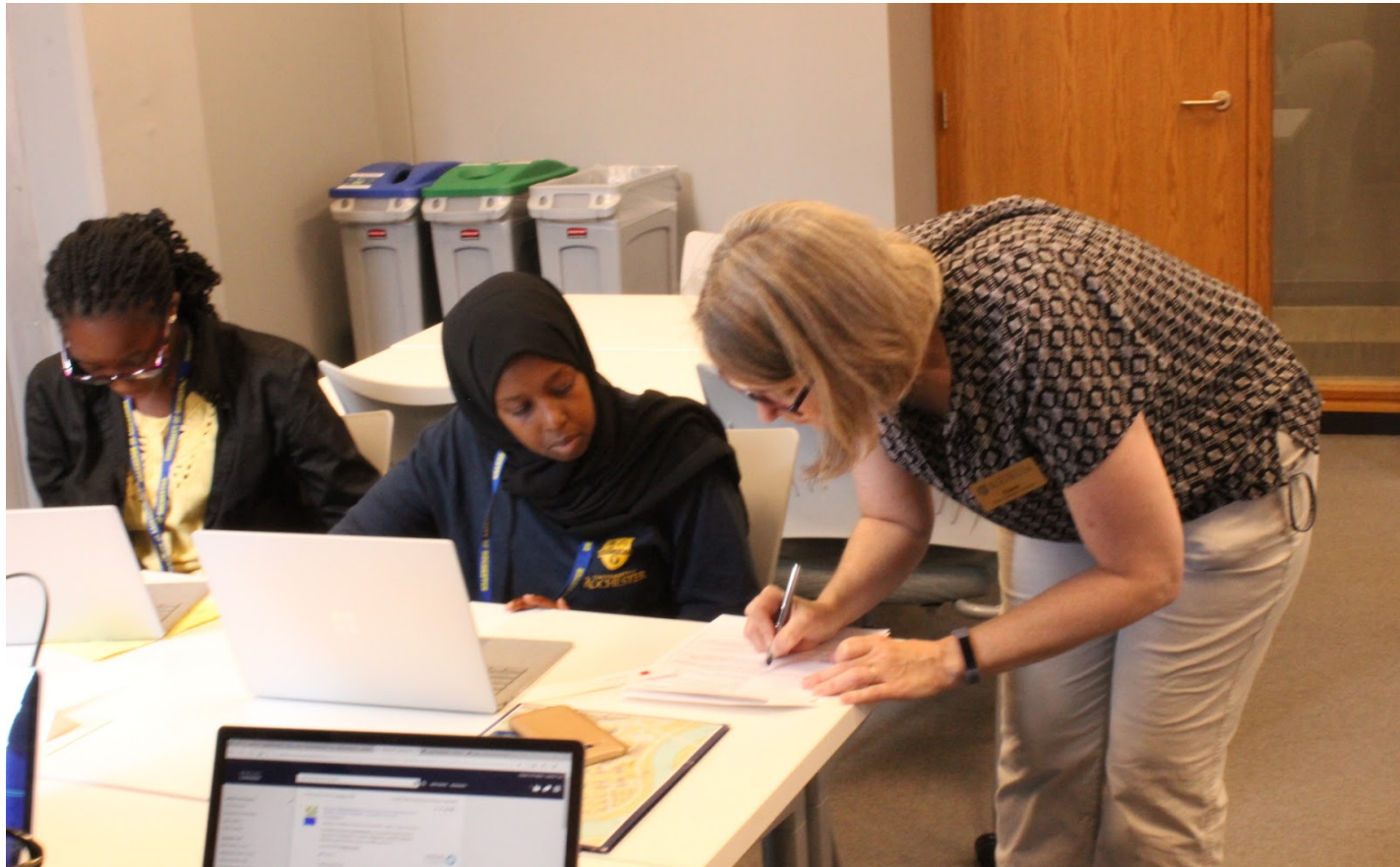
Culture of Collaboration: Early Connections Africa Program