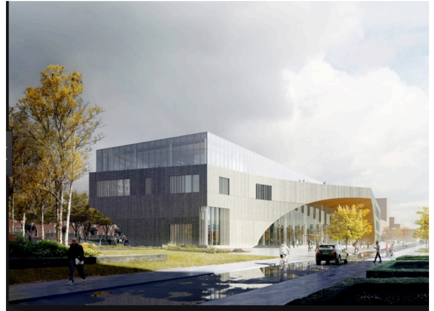
Snohetta Image – Temple U. Library